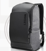
Lenovo Legion 15.6" Recon Gaming Backpack

* Example of Lenovo catalogue naming convention