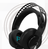
Lenovo Legion H300 Stereo Gaming Headset