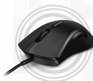
Lenovo Legion M300 RGB Gaming Mouse