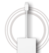
Lenovo USB-C 3-in-1 Hub