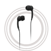
Lenovo 100 In-Ear Headphone