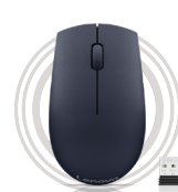
Lenovo 520 Wireless Mouse