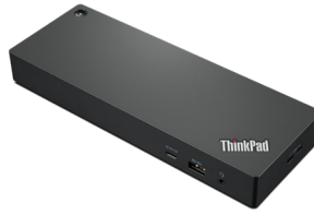
ThinkPad Universal Thunderbolt™ 4 Dock