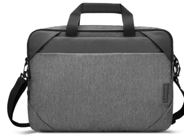
Lenovo Business Casual 15.6-inch Topload